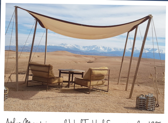
Atlas Mountains and Jebel Toubkal. Summitted in 1995.

Built by the British in 1908 the railway originally transported government officials and their families up to Ooty during the hot summer months. Now it carried tourists and steam train enthusiasts.